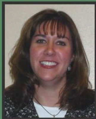
Northern MN Builders