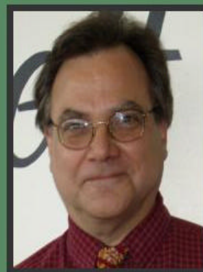
Myles Reif Center