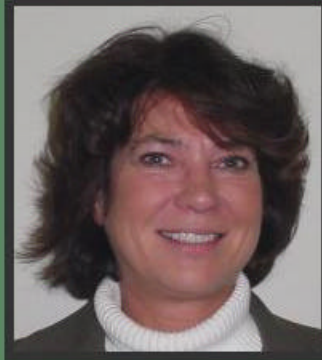
Itasca Economic Development Corporation