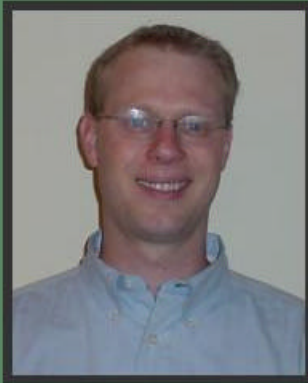
Ruttgers Sugar Lake Lodge