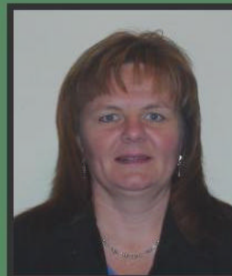
Taskmasters Handyman and Cabin Care