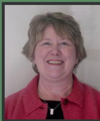
Up North Kettle Corn