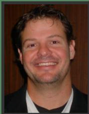
Paul Bunyan Telephone