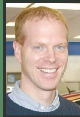
Grand Rapids GM