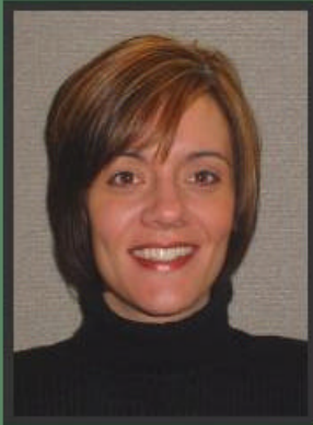
Something Original, Inc.